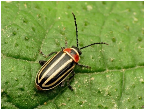
Striped flea beetle – adult.