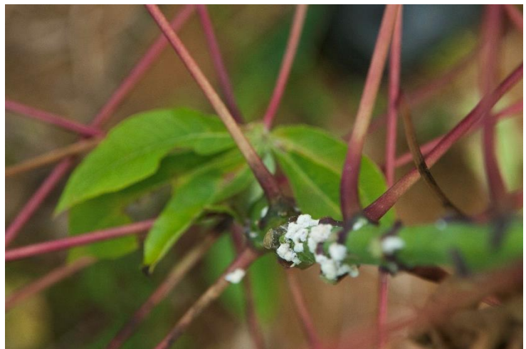
Mealybugs often found in colonies.