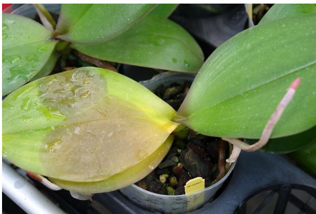
Water-soaked lesions caused by bacterial leaf blight.