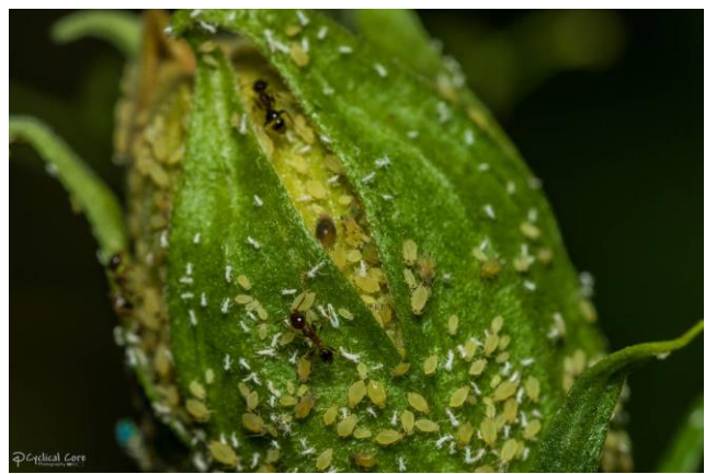
Aphids secrete honeydew that attracts ants.