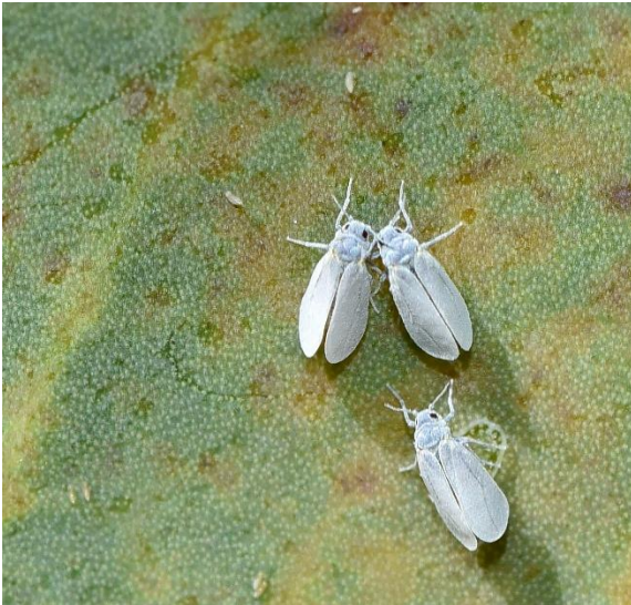
White fly – adult.