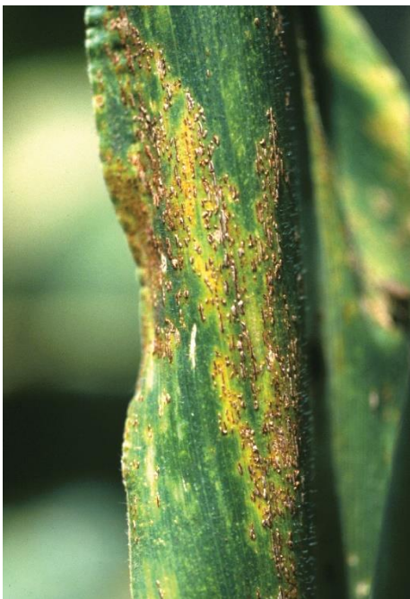
Leaf rust causes mass of brown spots on leaves.