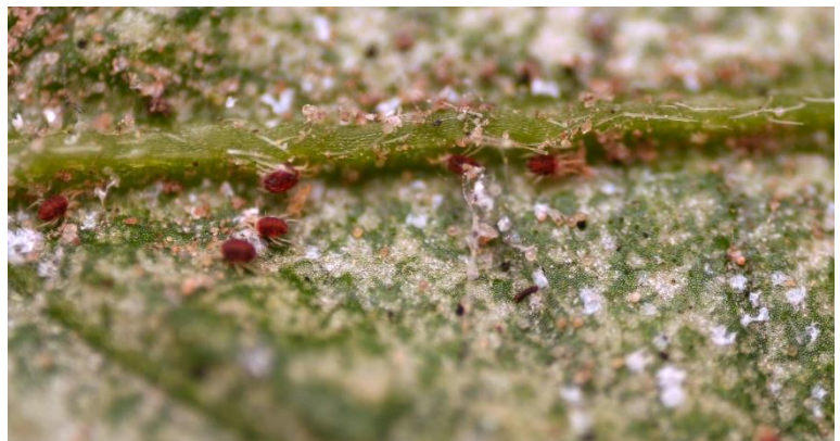
Spider mites on leaves - close up.