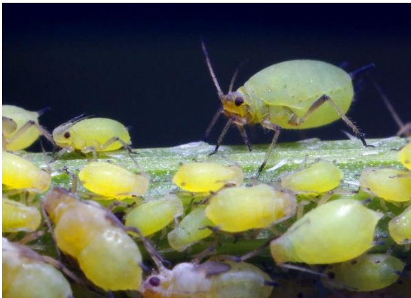
Aphids – adult.