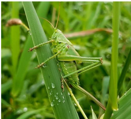
Grasshopper – adult.