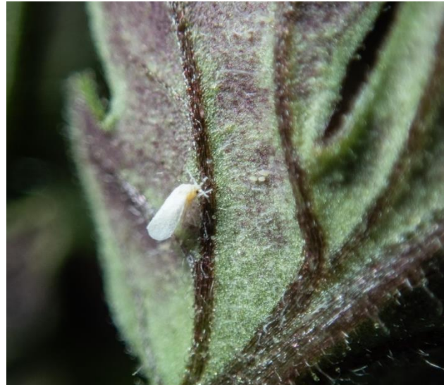
White fly - adult on tomato plant.