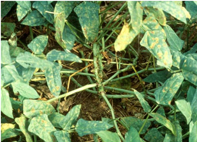
Thrips cause brown spots on leaves.