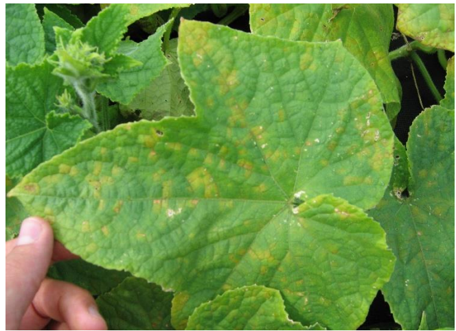
Downy mildew – cucurbit. Image from NY State IPM Program at Cornell University