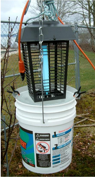
Light trap.

Light traps are suitable for species attracted to light, such as moths. Combine lights with sticky traps.