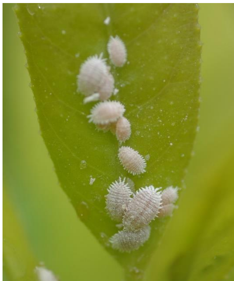
Mealybugs – adult.