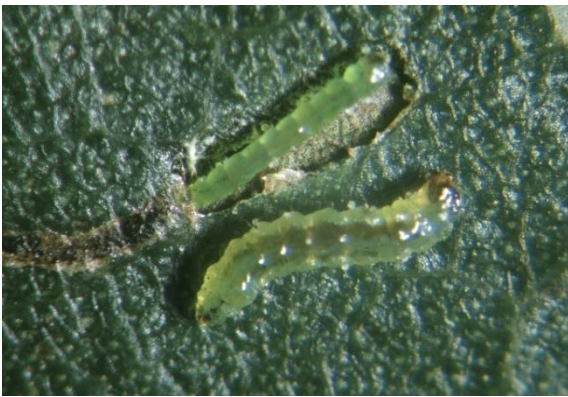
Leaf miner – larvae.