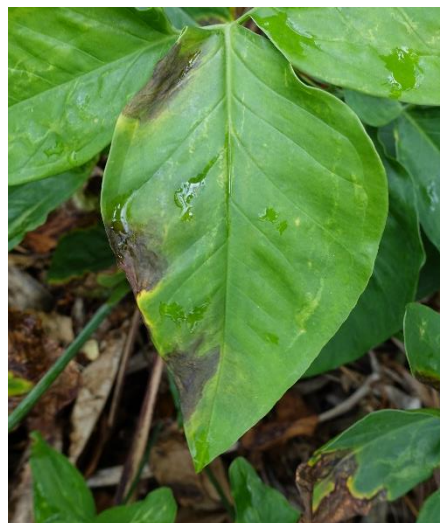
Darkened lesions on leaves caused by bacterial leaf blight.