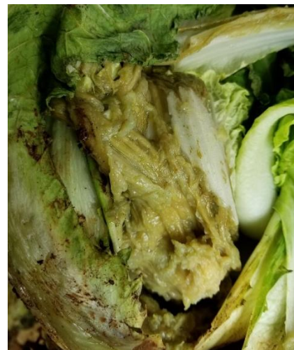
Bacterial rot - napa cabbage.