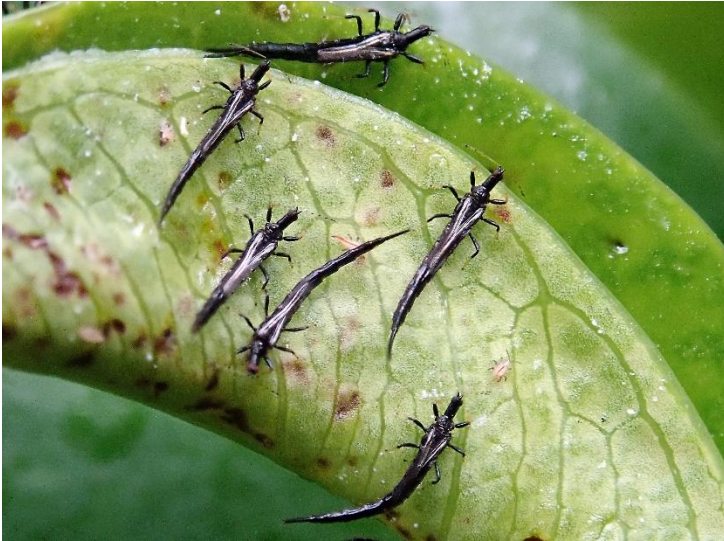
Thrips – adult.