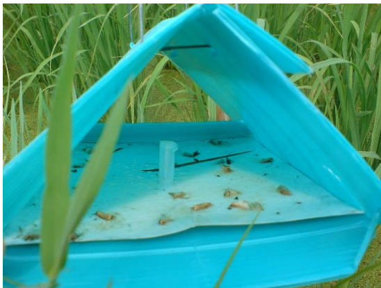
Pheromone trap. Image from Mehdi

Cons: non-specific so may trap a large number of insects, both pests and natural enemies of the pests which may affect their biological control potential in the area. Heavy rainfall could reduce stickiness of trap and will need to be replaced more often.