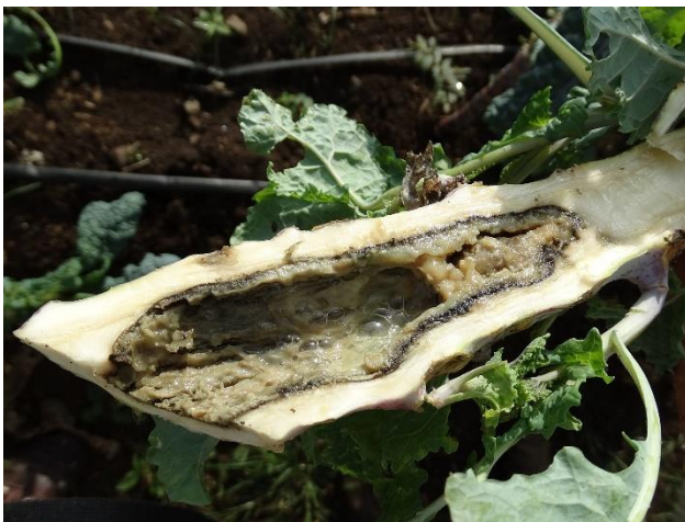
Bacterial rot – kale stem. Image from Awkwafaba