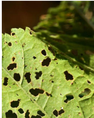
Flea beetle damage - small holes on leaves. Image from ulleo