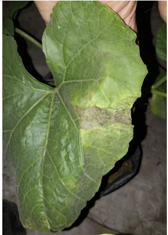
Brown areas develop between leaf veins due to thrips.