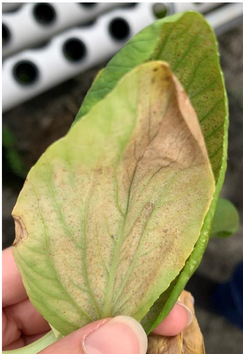
Tiny red dots on underside of leaves indicate spider mites.