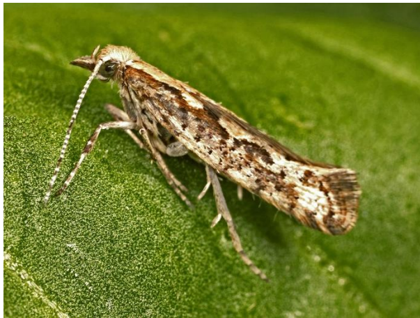
Diamondback moth – adult.