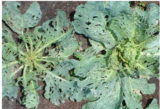
Diamondback moth larvae bites and creates holes in leaves.