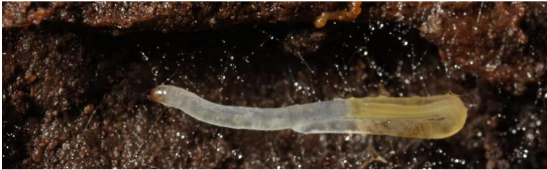
Fungus gnat – larvae.