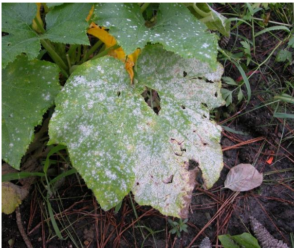
Powdery mildew.