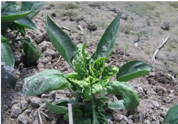
Viral leaf curl – capsicum.