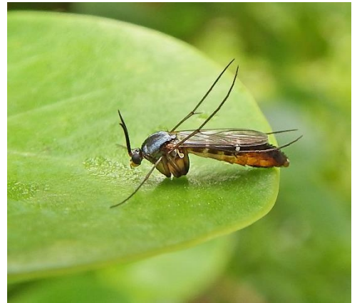
Fungus gnat – adult.