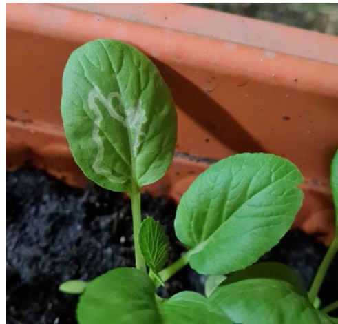
Mine trail made by leaf miner.