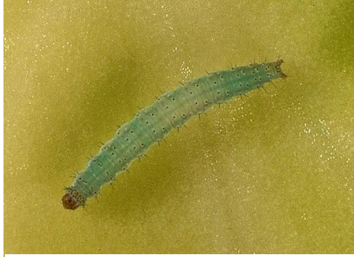
Diamondback moth – larvae.